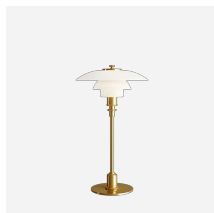
PH 2/1 Table