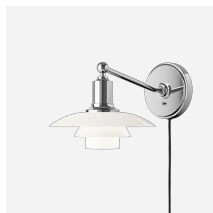
PH 2/1 Wall